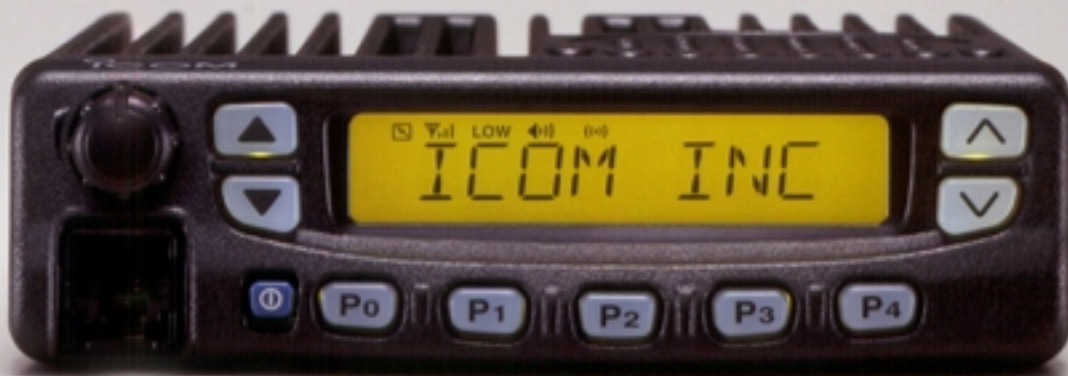
The photo shows actual size.